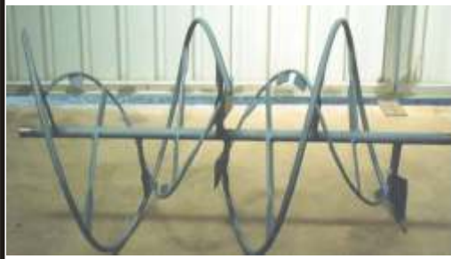
Unique Mixing Spiral

For abrasive materials a 5mm liner can be placed inside the bowl for easy replacement, and the mixing spiral can be hard faced.