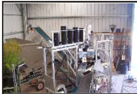
PF 2006 Potting Line