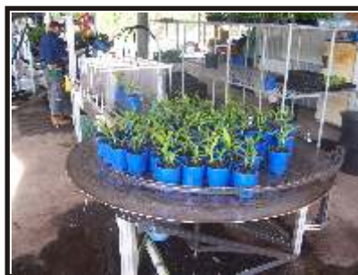
Pot Accumulator Turn Table