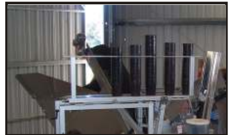
Pot Feed Belt and Dispenser