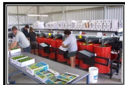
Electronic Inline Grader