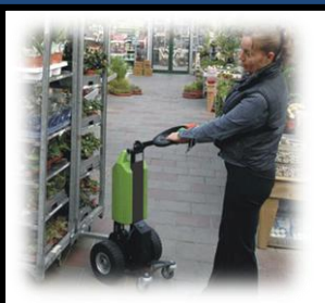
The LiftnMoveXX can be used to move nursery trolleys