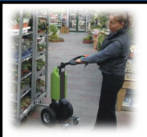
The LiftnMoveXX can be used to move nursery trolleys