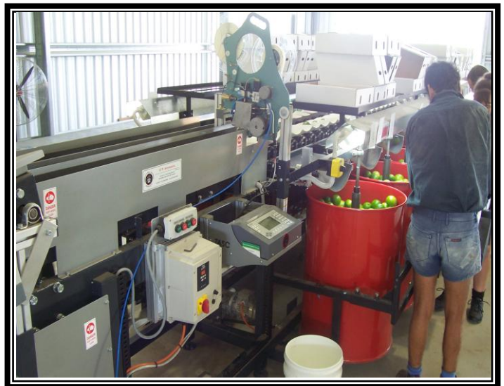
2 Lane Electronic Inline Grader Weight Sizer

The system's simplicity and ease of use contributed greatly to Luigi's decision to go with KW Automation. It is so easy to change and store programs for different fruits on the KW sizer. Further, the system's accuracy makes for easy packing.