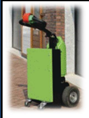
The LiftnMoveXX can move 1000kg

LiftnMoveXX models include stainless steel