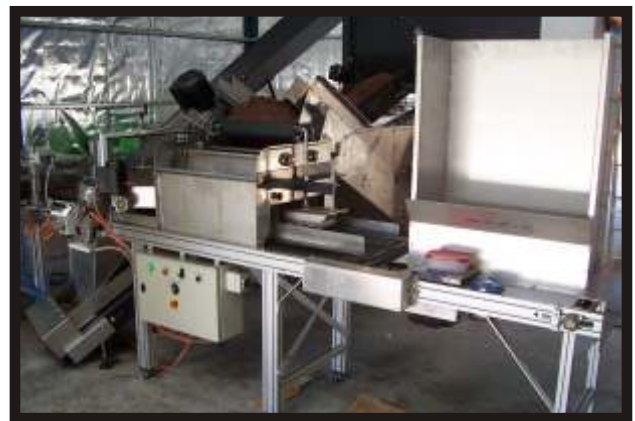
SHOWN WITH OPTIONAL TRAY DISPENSER